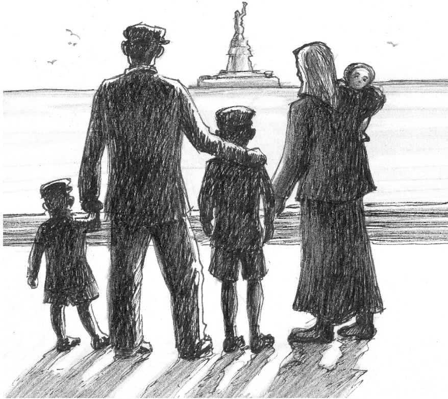
Ellis Island: Gateway To A Dream ~Sketch by Lila Quintero Weaver